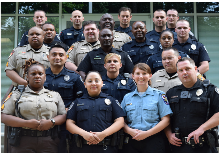
Pictured: Members of the June 2016 CIT class in Guilford County. More classes are scheduled throughout the catchment area in the coming months.

The importance of MHFA is widely recognized. The NC Department of Health and Human Services plans to train all state employees with help from Local Management Entities-Managed Care Organizations such as Sandhills Center. Recently, Gov. Pat McCrory said that North Carolina now has more people trained in MHFA than any other state in the country.